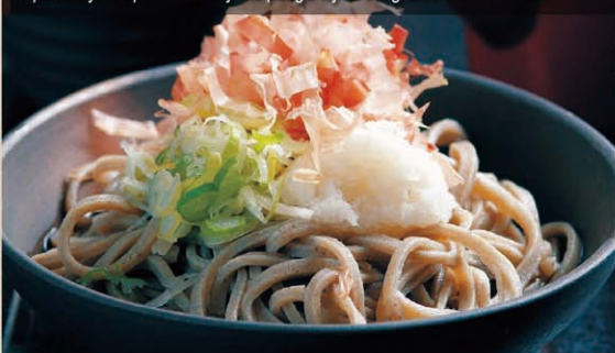
Wakasaji Gozen Lunch / Lunch platters made with the delicious ingredients southern Fukui Prefecture is known for.